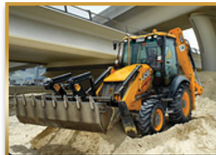
FRONT & BACK HOE LOADER