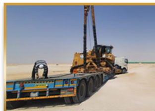
FLAT BED TRAILER