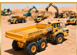
ARTICULATED DUMP TRUCK